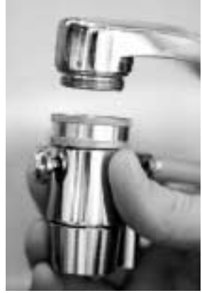
Figure 10 Attaching diverter to Faucet